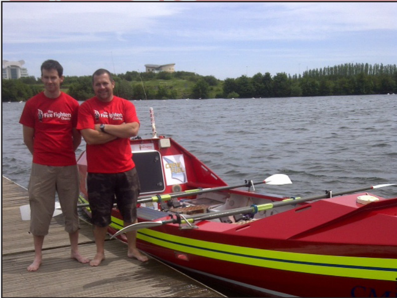
Launch in Cardiff Bay