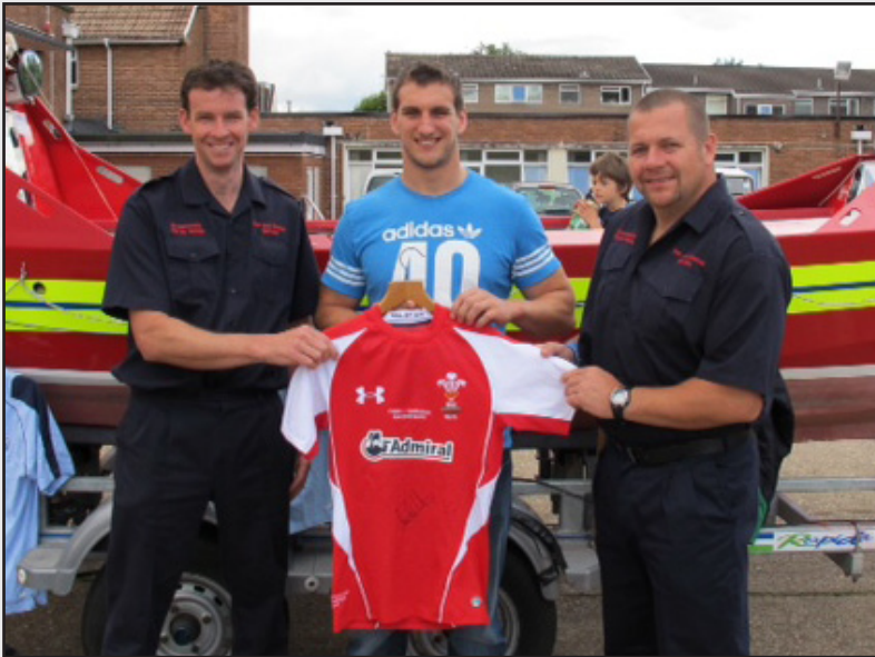
Welsh Rugby international Sam Warburton donates his captain's shirt for auction